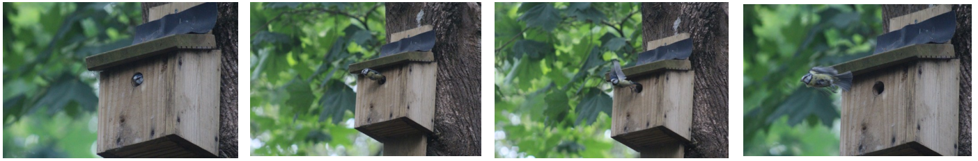
Blue tits hard at work nesting in one of our many nest boxes.