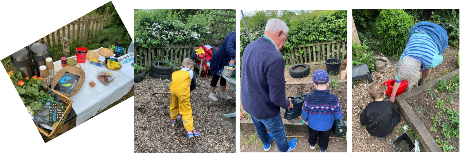
Y1&2 grandparent gardening.