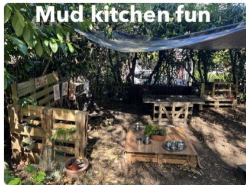
Mud kitchen fun