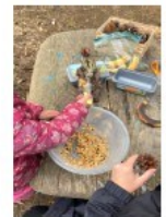
Homemade bird food

Five week course Friday 9.30—11am 23/2, 1/3, 8/3, 15/3, 22/3, Places are for 1 adult & 1 child (aged 18months—4 years) Sibling discount prices available. Booking essential, full course and pay as you go available forest@stpeters-farnham.surrey.sch.uk