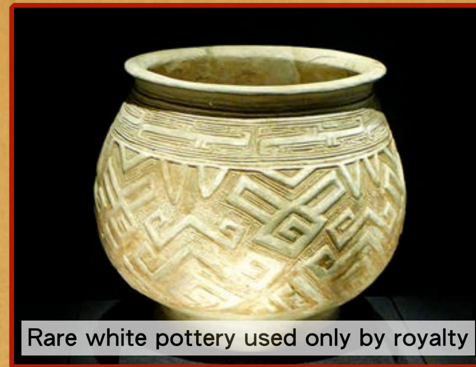
Rare white pottery used only by royalty