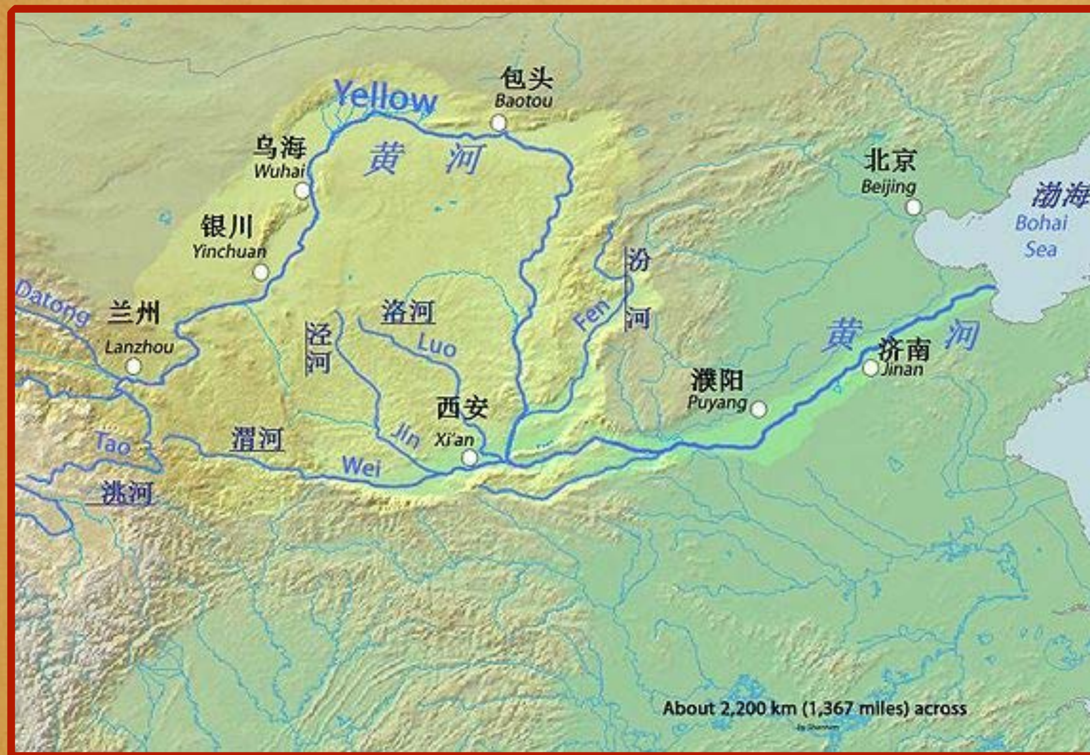
Map of the Yellow River

Outside of the city, farmers grew crops such as millet, wheat and barley, and only a little rice which was more commonly grown further south. The land of the Shang Dynasty was irrigated with water from the Yellow River which made it very fertile.