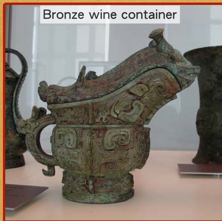
Bronze wine container