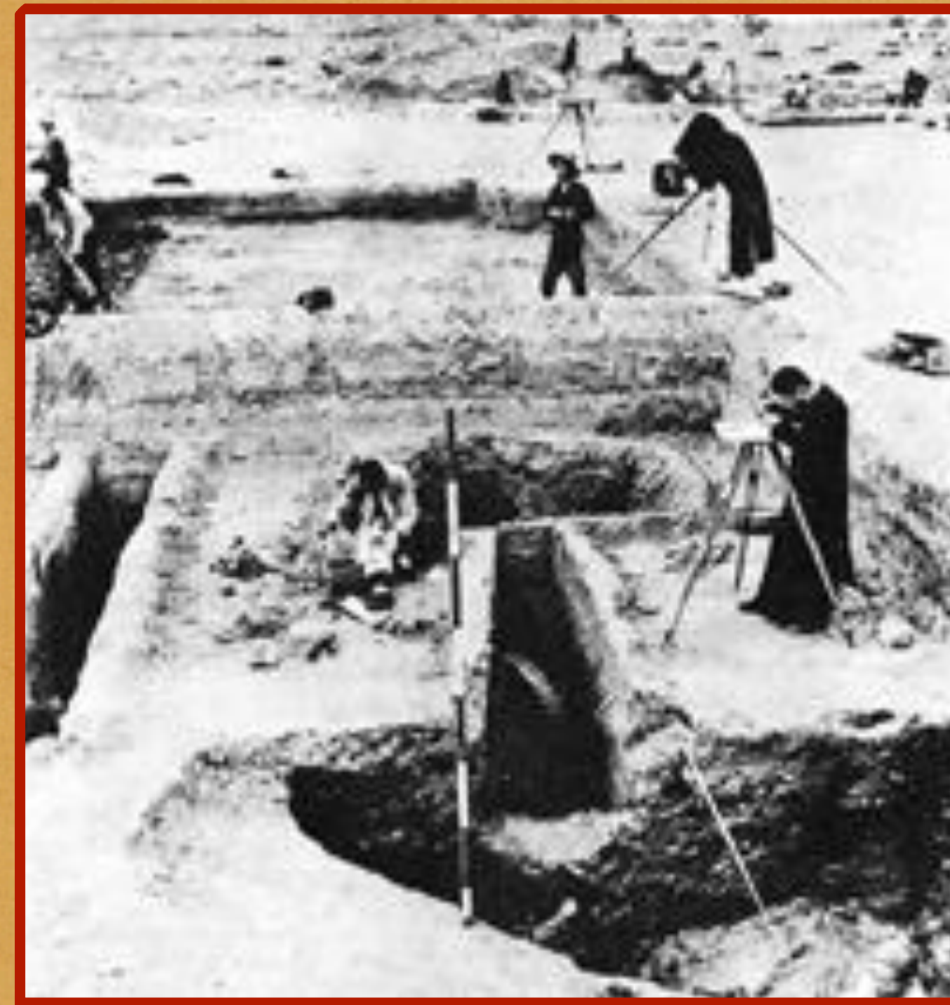
This picture shows Chinese archaeologists excavating houses in 1930

Cooking was done on a central hearth using metal or pottery cooking vessels.