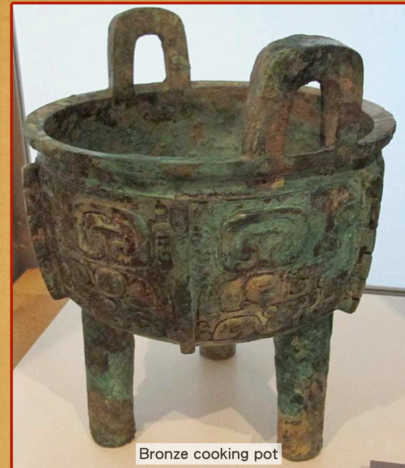
Bronze cooking pot