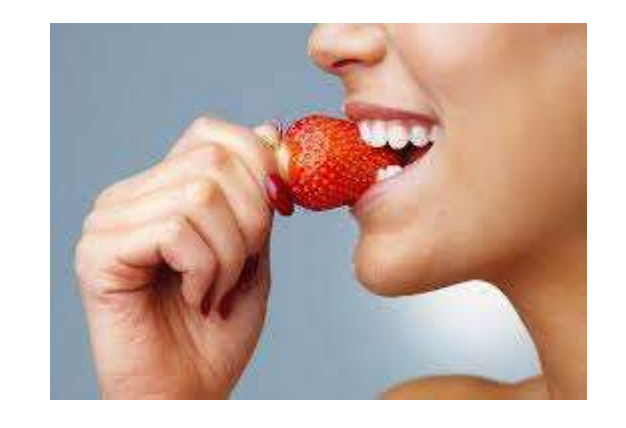
Taste crispy savoury spicy