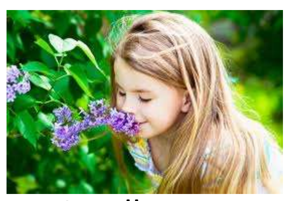
Smell familiar cheesy spicy strong