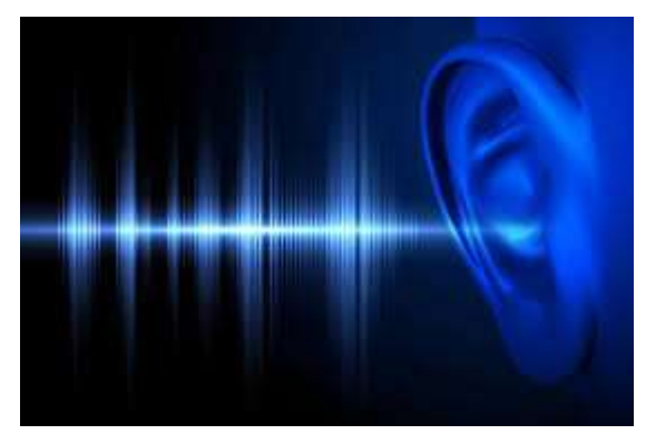
Sound crunch snap