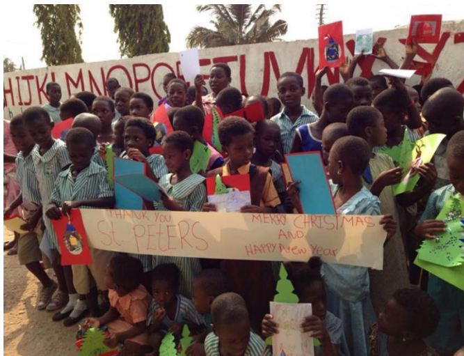
Children at the UCC, with Christmas cards from St. Peter's pupils

At St Peter's we see ourselves as citizens of the world. As such we have designed our curriculum to include learning about other cultures, countries and peoples. For example, in English we try to ensure that we have links to literature from other parts of the world and in our curriculum cookery classes, pupils learn to make dishes from other cultures.