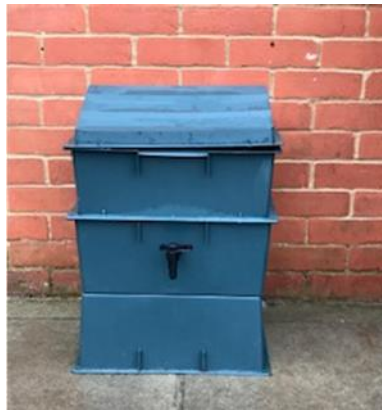
Presenting our wormery

Gardening club have purchased a new habitat for children to learn from out of the money raised at the Christmas sale.