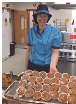
Fairtrade banana muffins for lunch.